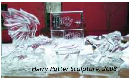
Harry Potter Sculpture, 2008

Enjoy the variety of pastel works created by the members of the Great Lakes Pastel Society living in the Ann Arbor area. Meet the artists on Saturday, February 7, 4–6 pm.