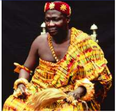
Asante Paramount Chief of Ejisu, Nana Diko Pim III, wears a rare Asasia Oyokoman Adweneasa cloth, Ejisu, Ghana, 1976.

Ice carving in the park is back! Bring your family downtown to the Library Park Plaza and watch J.R. transform 600 pounds of ice into a frozen work of art. The carving begins around 10 am—stop by often to view the ice sculpture as it emerges throughout the day.