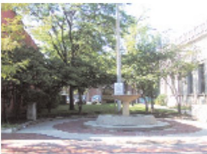
Library Park as of August 2005