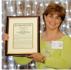
YDL was awarded a congressional declaration celebrating our 150th year

150 years ago, the first lending library in Ypsilanti was established by six women with a vision to promote literacy, support democracy, and build a vibrant community.